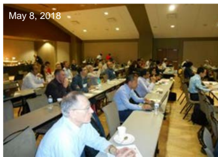
Sixth Smart Grid Workshop, College Station, TX.

More than 140 attended including 55 students, 14 postdocs and research staff, 48 faculty members, and 15 representatives from industry (ABB, CNP, EPG, ComEd, Esri, GE, Landis+Gyr), government entities (NREL, PNNL), and non-profit organizations (EPRI, ERCOT). NSF Travel grant was awarded to 38 participants.