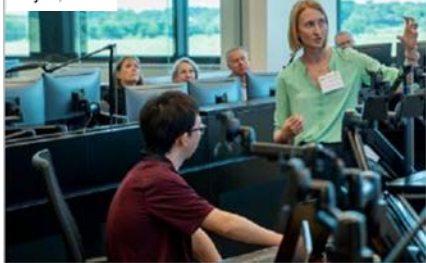
Demonstration for Advisory Board members and guests at the Smart Grids Control Center.